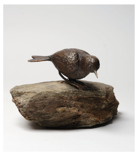
The Starling Cast Bronze, Schist, 16.5 x 30 x 17 cm Edition of 3