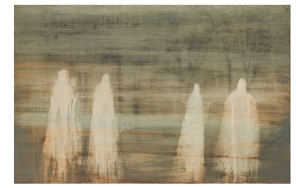
Tūpuna Oil on board, 500 x 750 mm