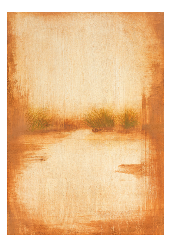
Riverside Oil on board, 750 x 500 mm