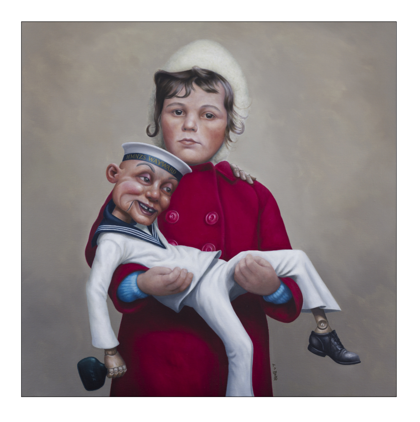
Adrift Oil on linen, 900 x 900 mm Signed lower right