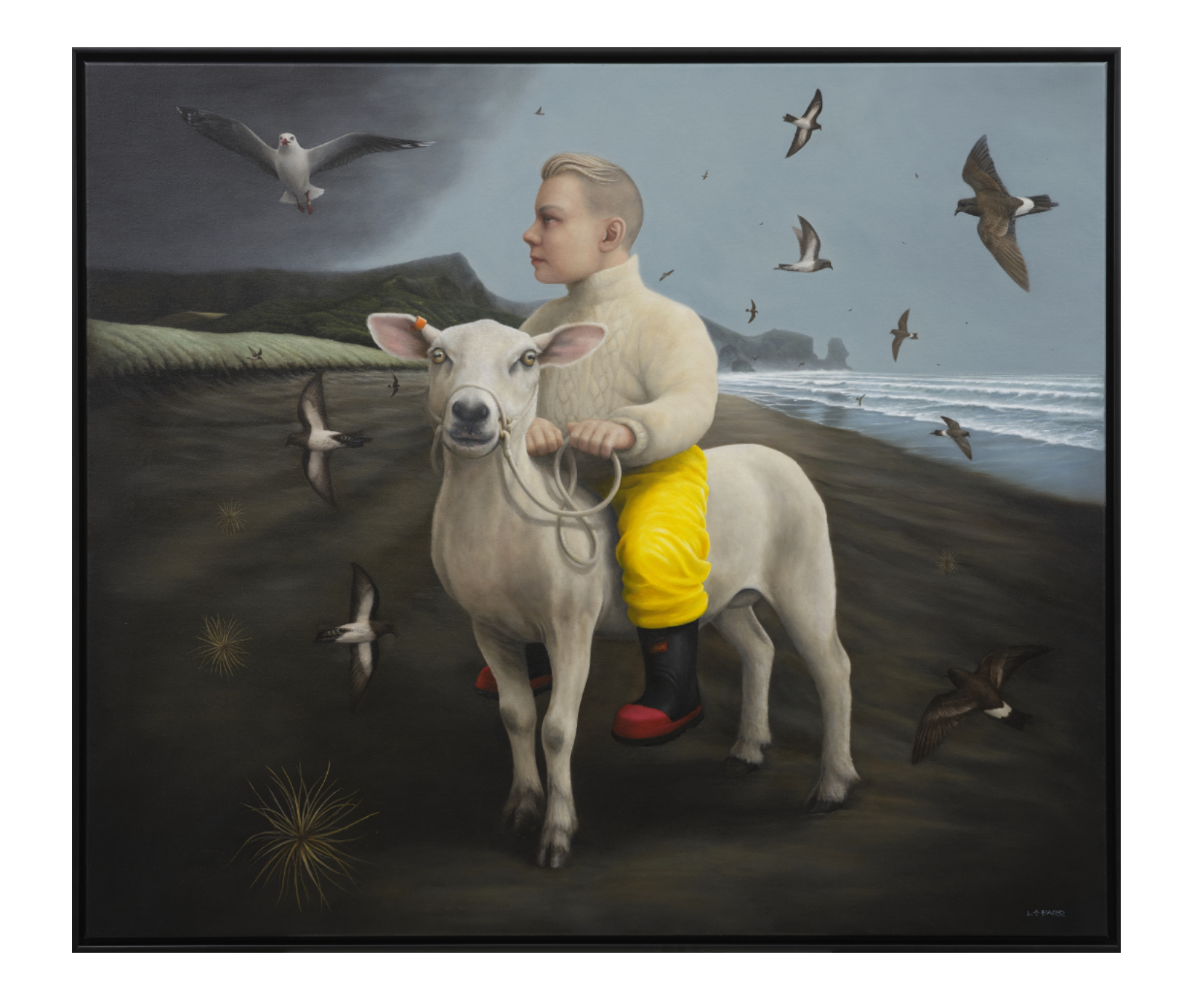
Windshift Oil on linen, 1200 x 1400 mm Signed lower right