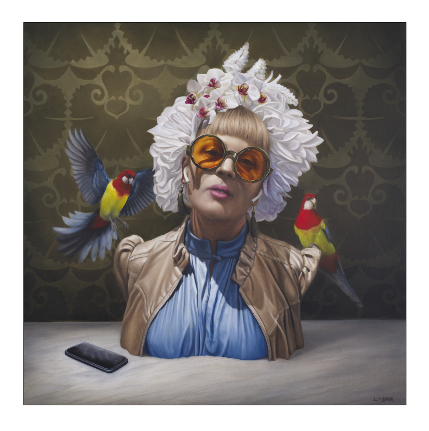
Night Owl Oil on linen, 900 x 900 mm Signed lower right