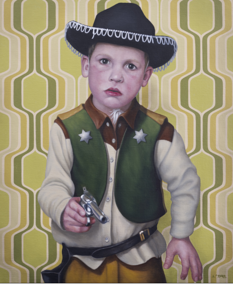
Showdown Oil on linen bonded to birch panel, 800 x 645 mm Signed lower right