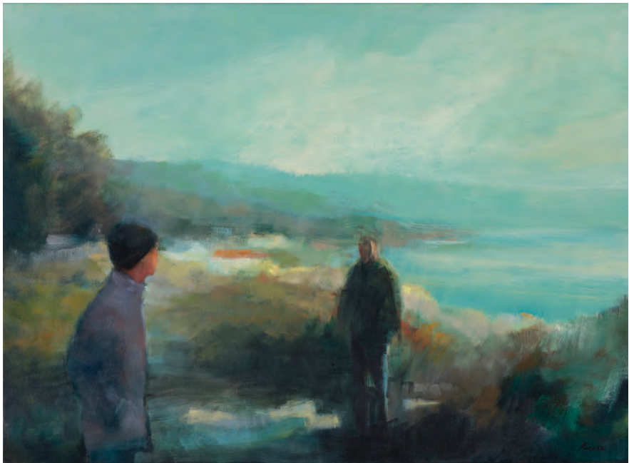
Elizabeth Rees Back in Town , oil on canvas, 555 x 750 mm