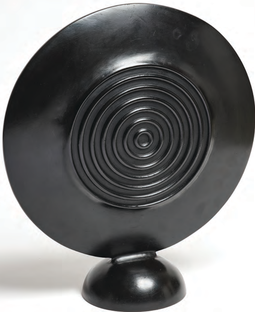
Marté Szirmay Galactic Voyager , bronze, 335 x 110 x 280 mm