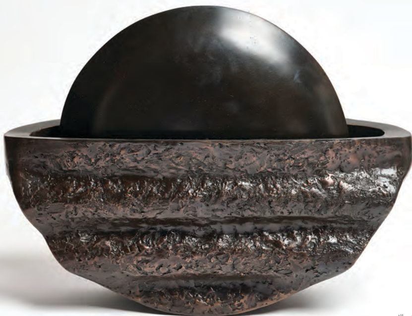
Marté Szirmay Earthlight - Dawn/Dusk , bronze, 375 x 500 x 160 mm