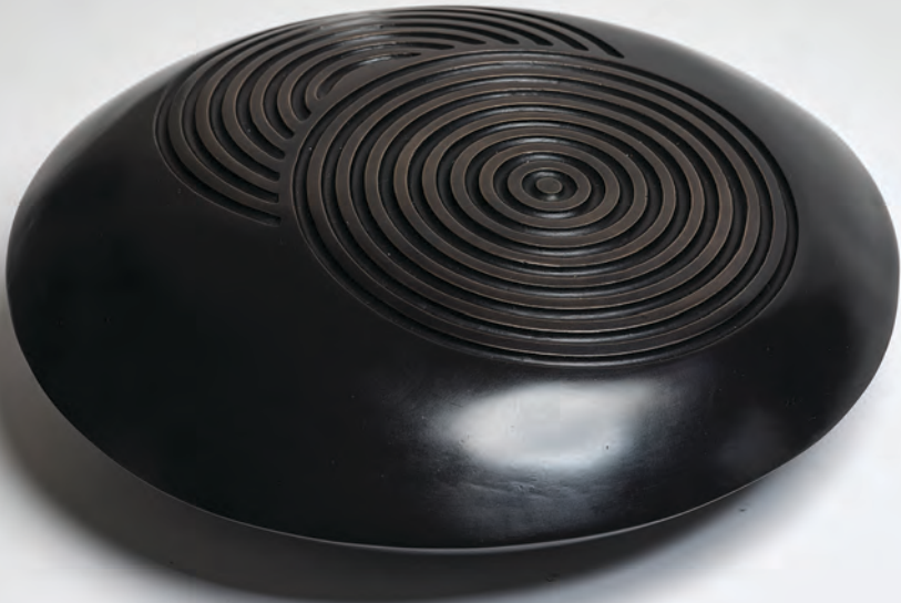
Marté Szirmay Touch of Sun , bronze, 140 x 370 mm