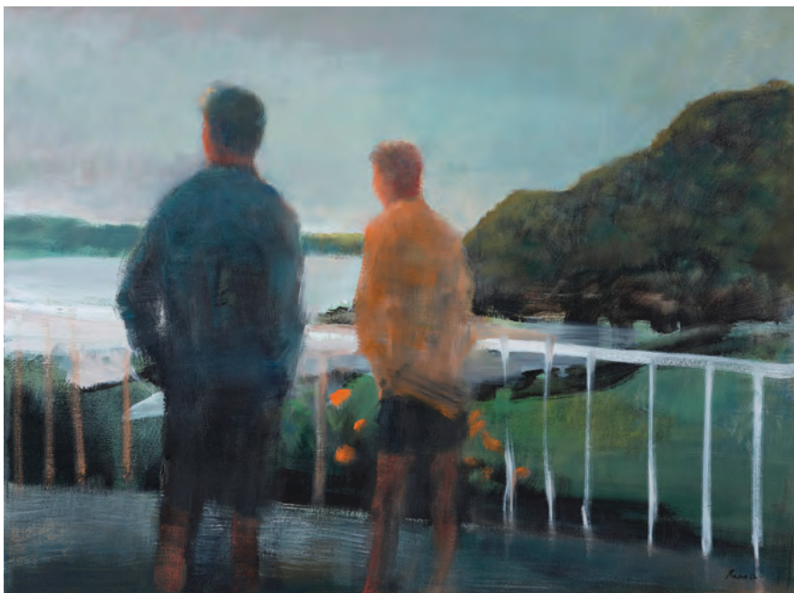
Elizabeth Rees Neighbour's Oranges , oil on canvas, 450 x 600 mm