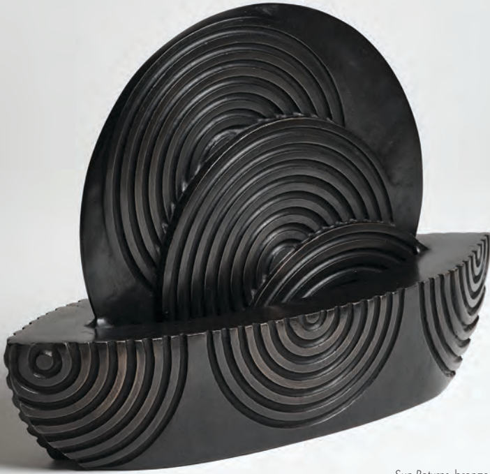
Marté Szirmay Sun Returns , bronze, 310 x 100 x 410 mm