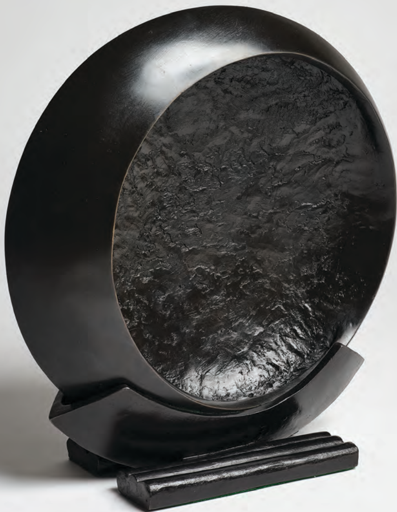
Marté Szirmay Eclipse, bronze, 400 x 370 x 150 mm