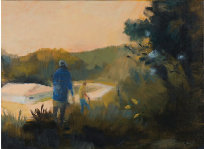
Elizabeth Rees In The Garden , oil on canvas, 555 x 750 mm