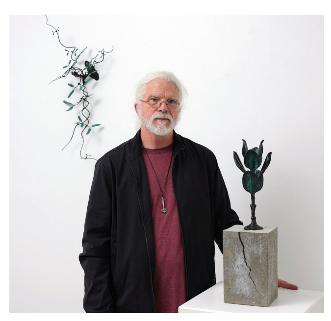
Mangemange Climbing Cast and fabricated bronze, 1000 x 460 x 185 mm Bronze and concrete, 550 x 155 x 155 mm